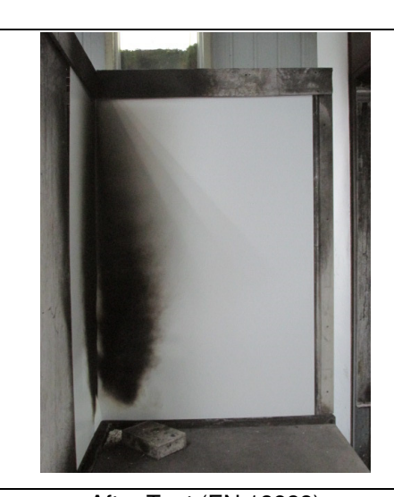
After Test (EN 13823)

Note: The above test was carried out by SGS-CSTC Standards Technical Services Co., Ltd. Shunde Branch.